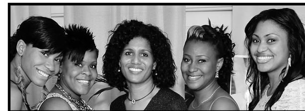
MINISTER OF LABOUR AND SOCIAL SECURITY Dr the Hon. Esther Byer Suckoo (centre) pictured with the Samuel Jackman Prescod Polytechnic's finalists in the Hairdressing category of the WorldSkills Barbados Competition, scheduled to take place March 7 to 9.

The WorldSkills Barbados Competition is being organised by the TVET Council.