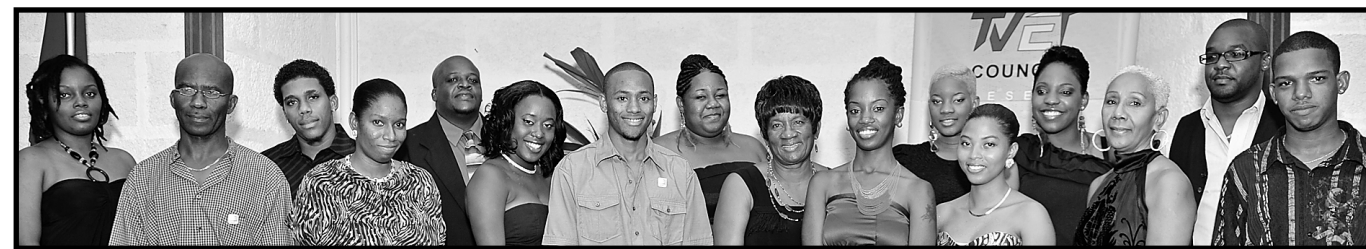
THE BARBADOS VOCATIONAL TRAINING BOARD'S finalists and coaches in the Fashion, Culinary Arts, Hairdressing and Automotive categories of the WorldSkills Barbados Competition.

MANY COUNTRIES are redeveloping their Technical and Vocational Education and Training (TVET) strategies in an effort to bring about increased economic development, and Barbadians must be made aware that the acquisition of technical and vocational skills is an asset in this new economy.