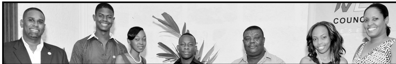
THE BARBADOS COMMUNITY COLLEGE'S finalists and coaches in the Fashion and Culinary Arts categories of the WorldSkills Barbados Competition. (GP)