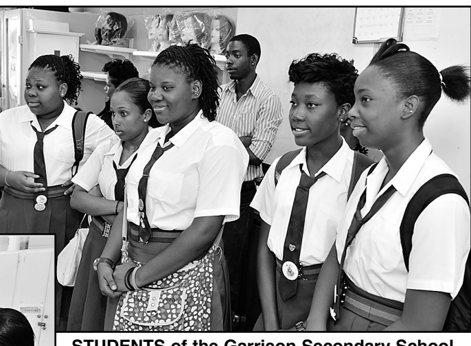
STUDENTS of the Garrison Secondary School paying rapt attention during the hairdressing component of the WorldSkills Barbados Competition. (GP)